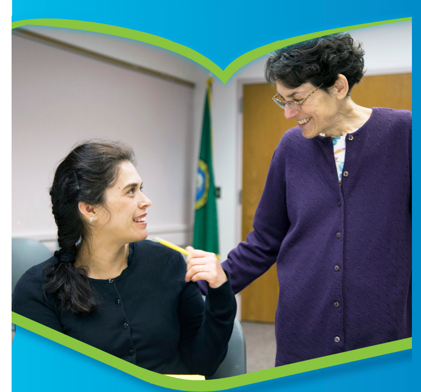
"I have English classes twice a week. I like my classes because I learn every day. I put a lot of my effort to keep learning." - ELL Student